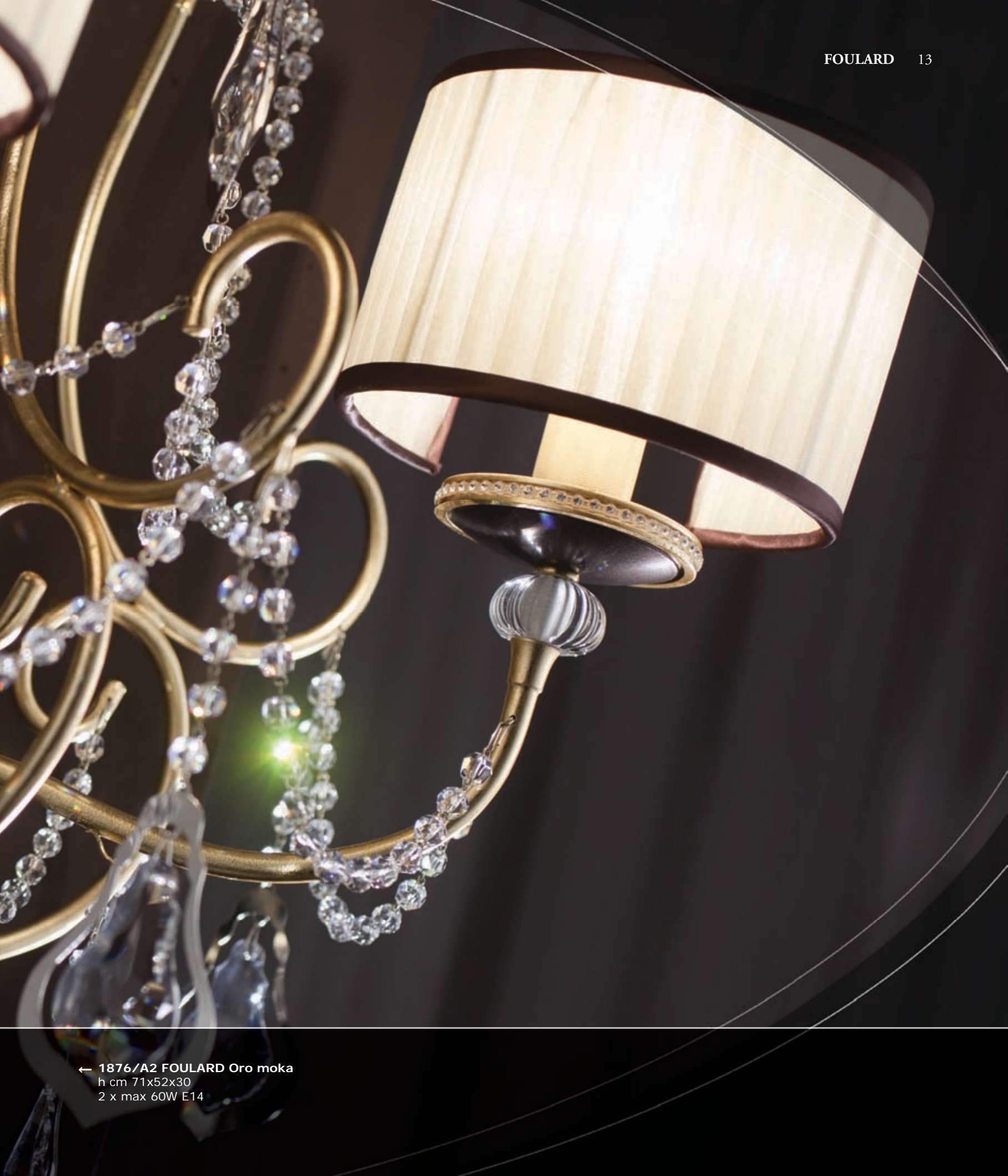
← 1876/A2 FOULARD Oro moka h cm 71x52x30 2 x max 60W E14