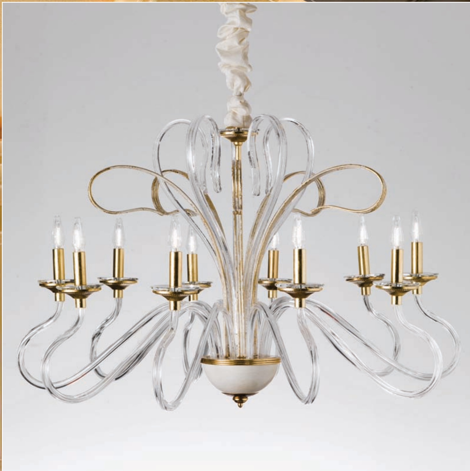
1878/10 DECO Bianco oro Ø cm 105x70 h 10 x max 60W E14