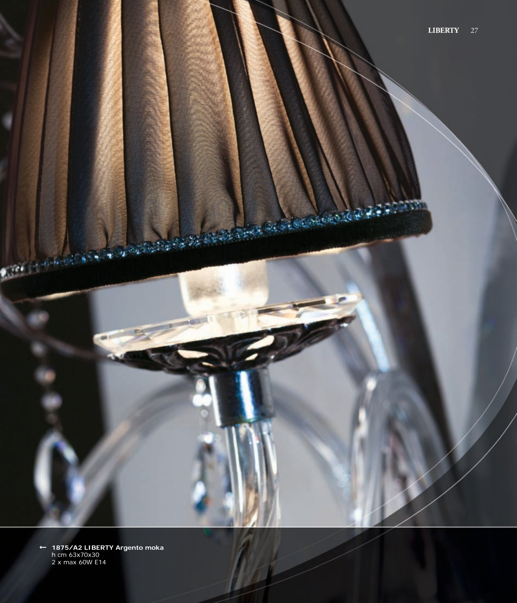
← 1875/A2 LIBERTY Argento moka h cm 63x70x30 2 x max 60W E14