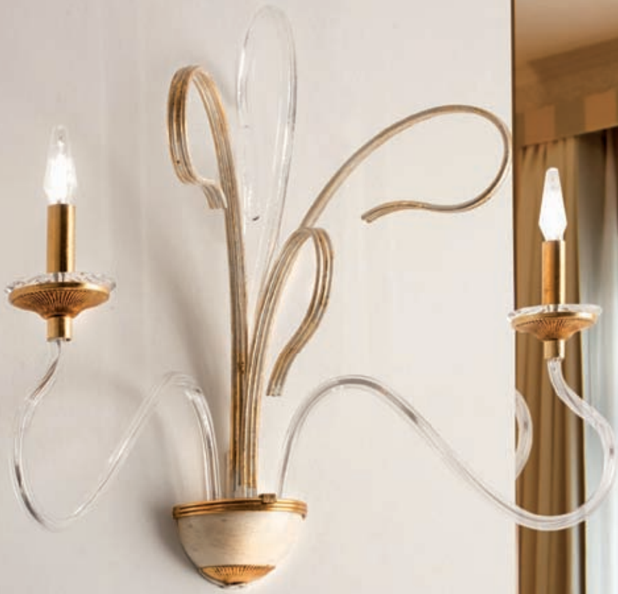
↑ 1878/A2 DECO Bianco oro h cm 63x70x30 2 x max 60W E14