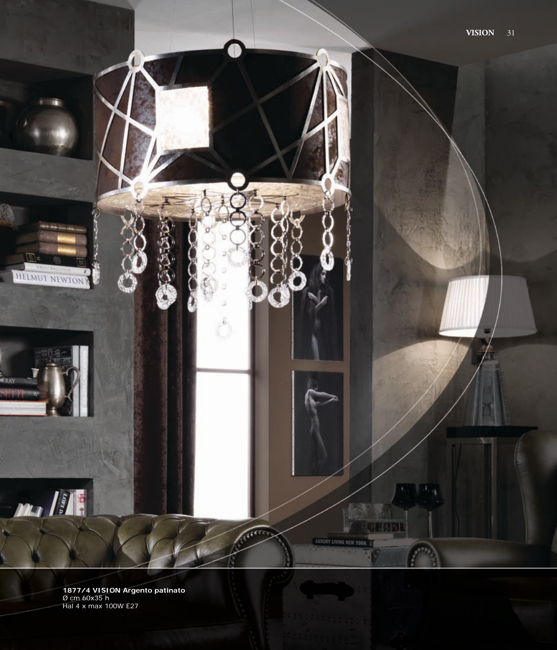
1877/4 VISION Argento patinato Ø cm 60x35 h Hal 4 x max 100W E27