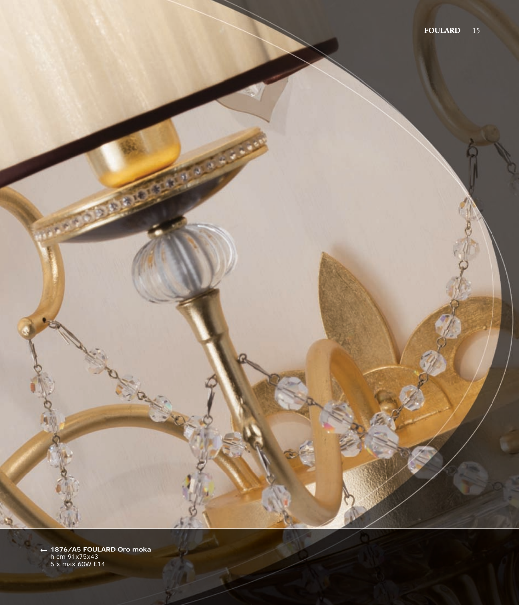
← 1876/A5 FOULARD Oro moka h cm 91x75x43 5 x max 60W E14