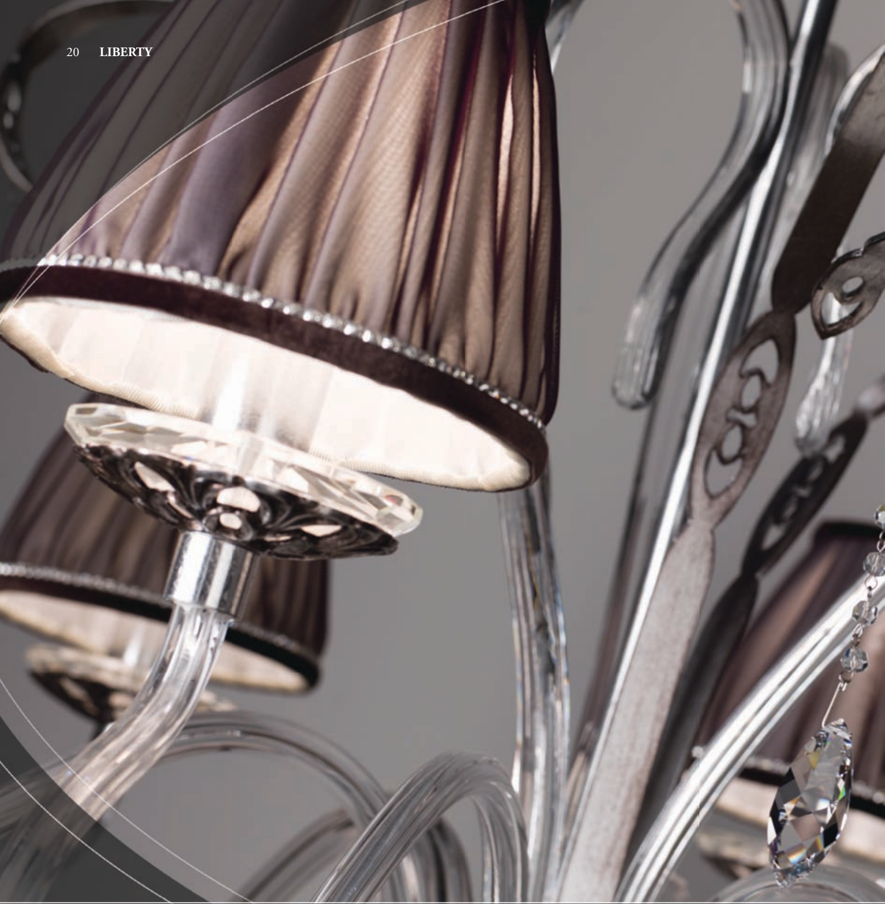
→ 1875/6 LIBERTY Argento moka Ø cm 85x63 h 6 x max 60W E14