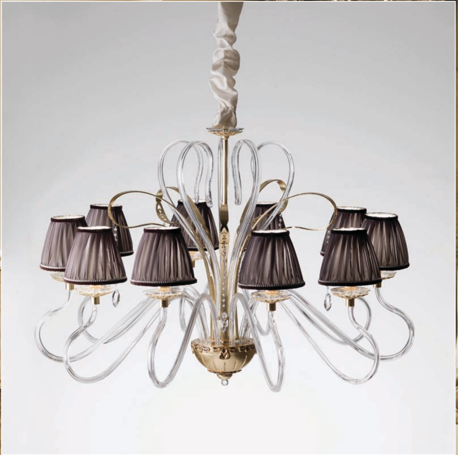
↑ 1875/10 LIBERTY Oro cannella Ø cm 105x70 h 10 x max 60W E14