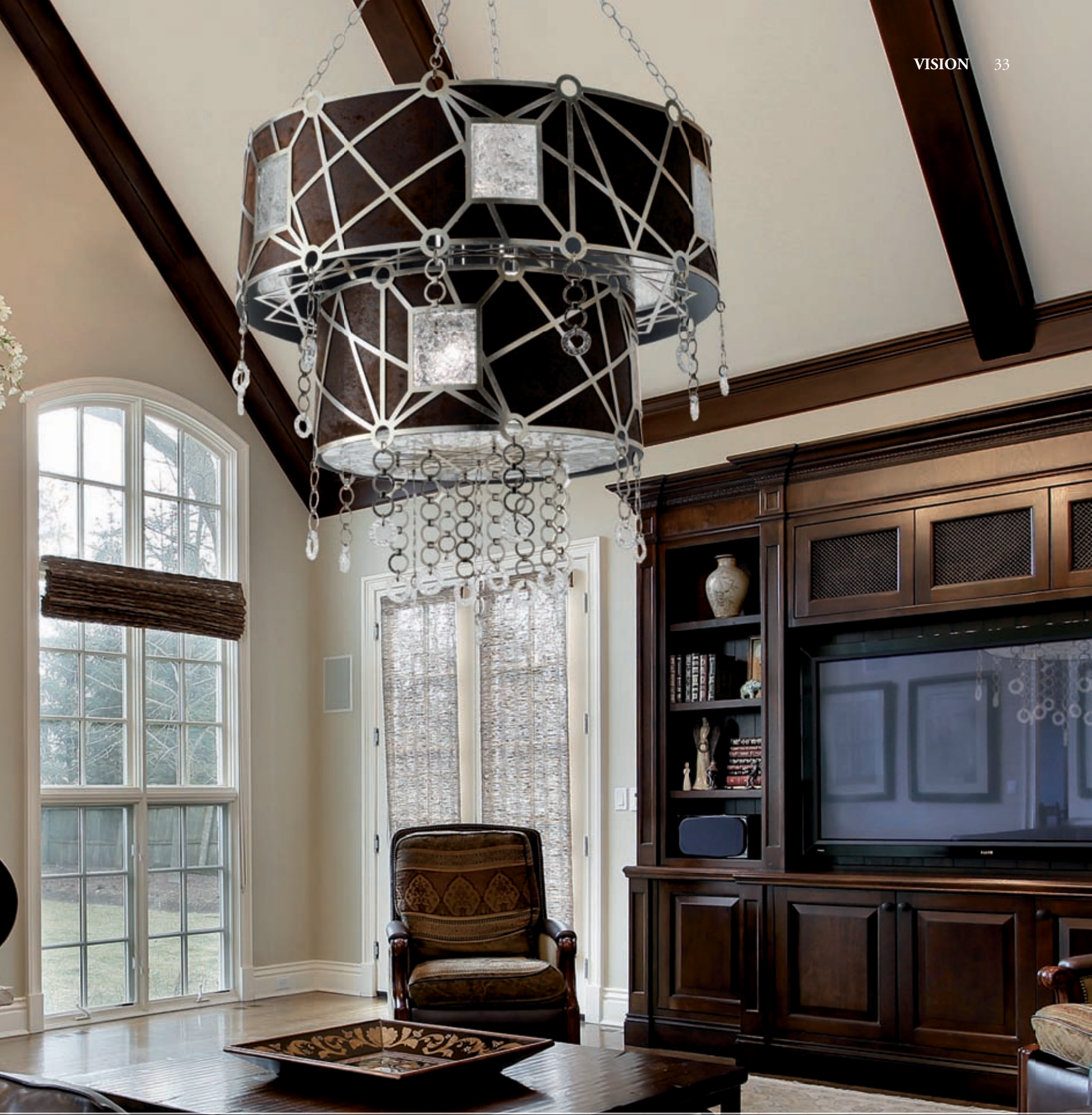
1877/8 VISION Argento patinato Ø cm 90x65 h Hal 8 x max 100W E27