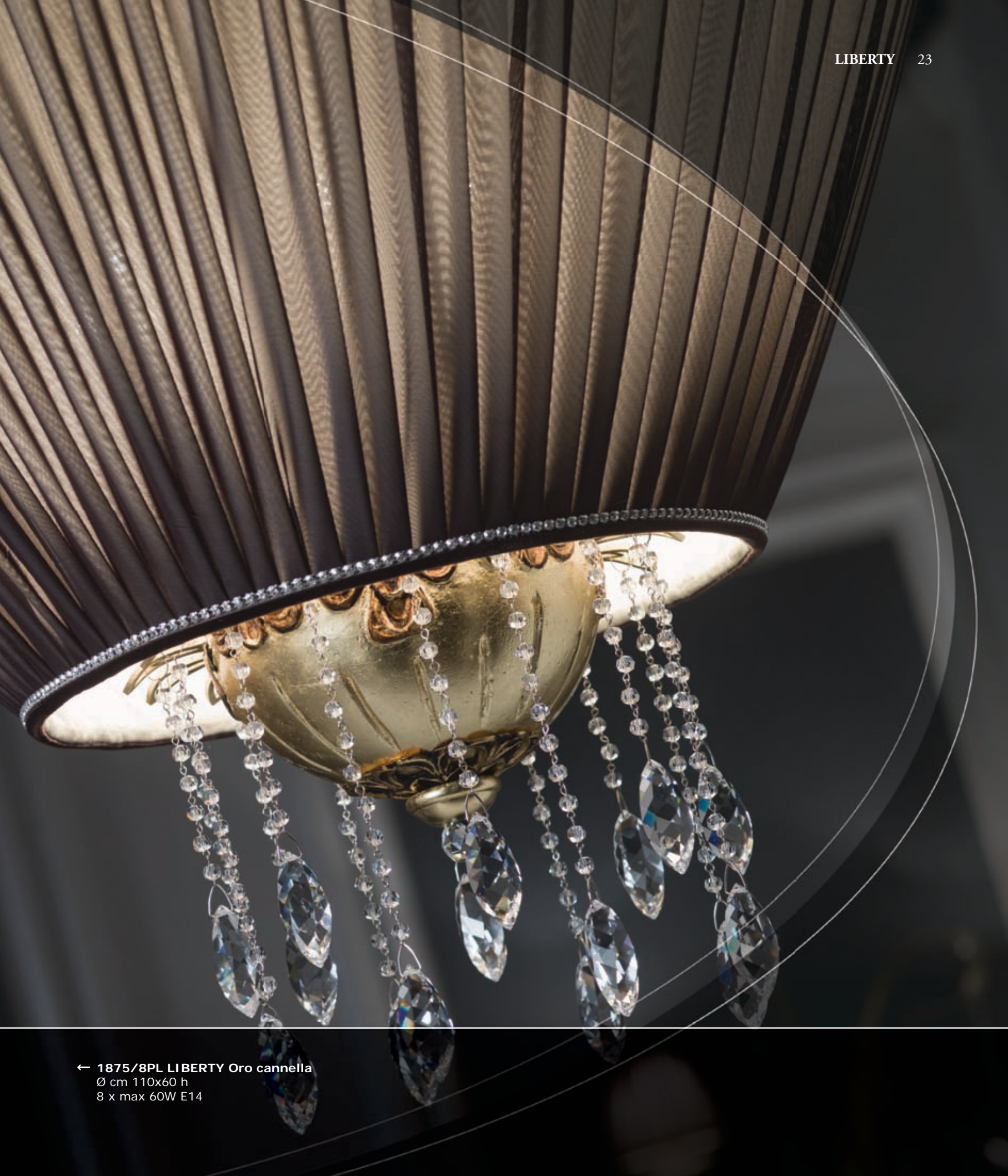
← 1875/8PL LIBERTY Oro cannella Ø cm 110x60 h 8 x max 60W E14