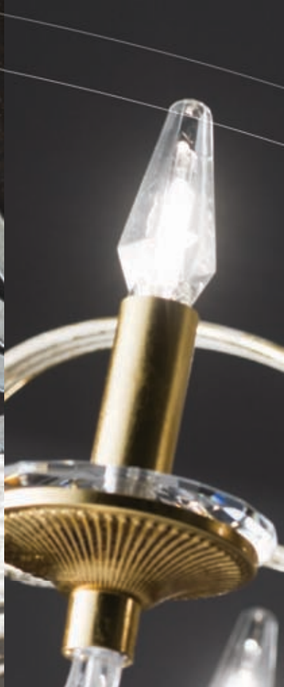
DECO pag. 38