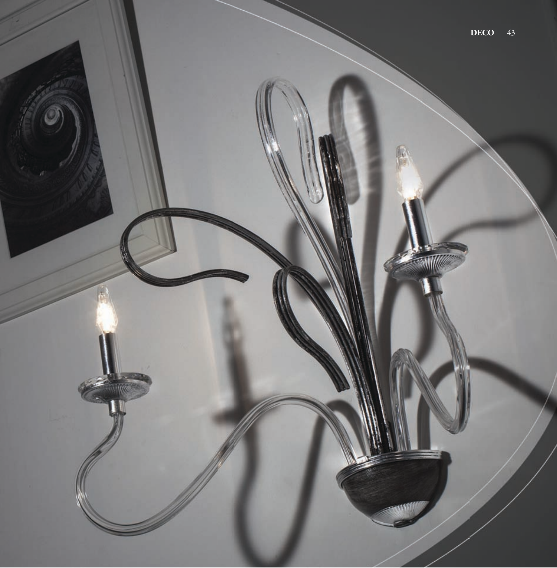
← 1878/6 DECO Piombo argento Ø cm 85x63 h 6 x max 60W E14