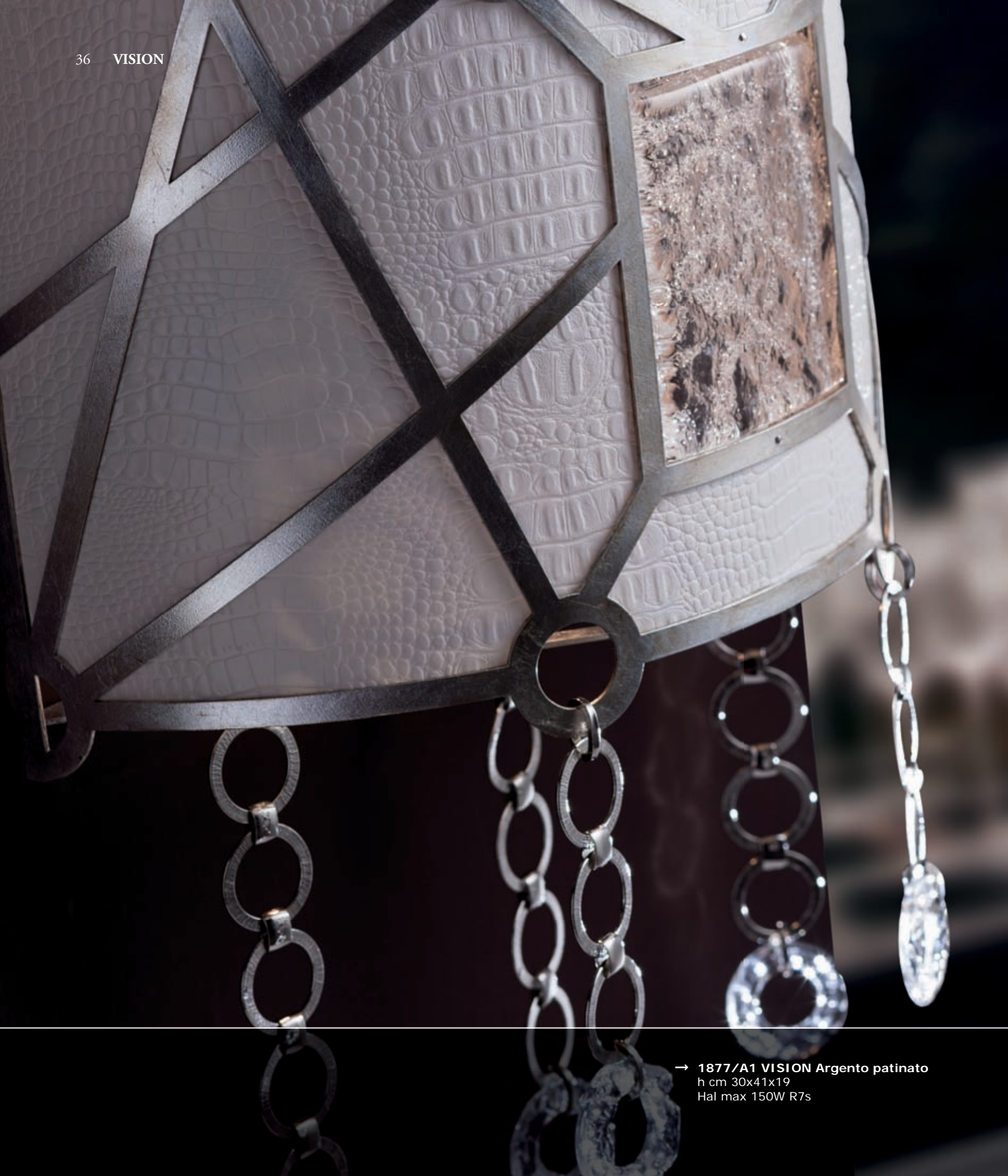
→ 1877/A1 VISION Argento patinato h cm 30x41x19 Hal max 150W R7s