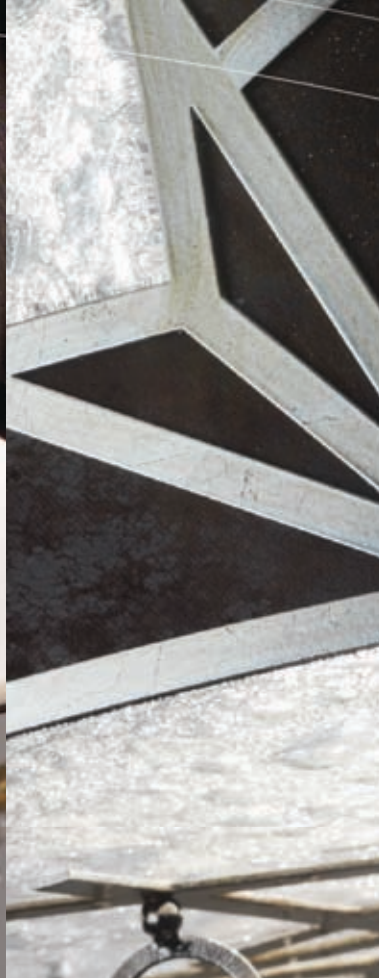
VISION pag. 28