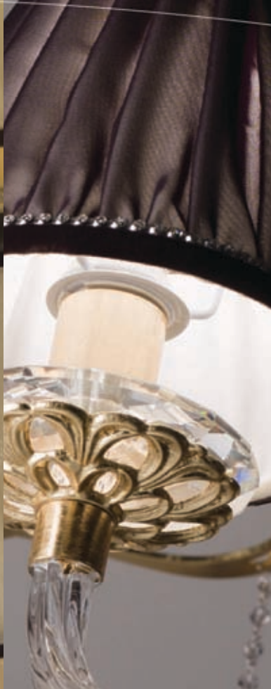
LIBERTY pag. 16