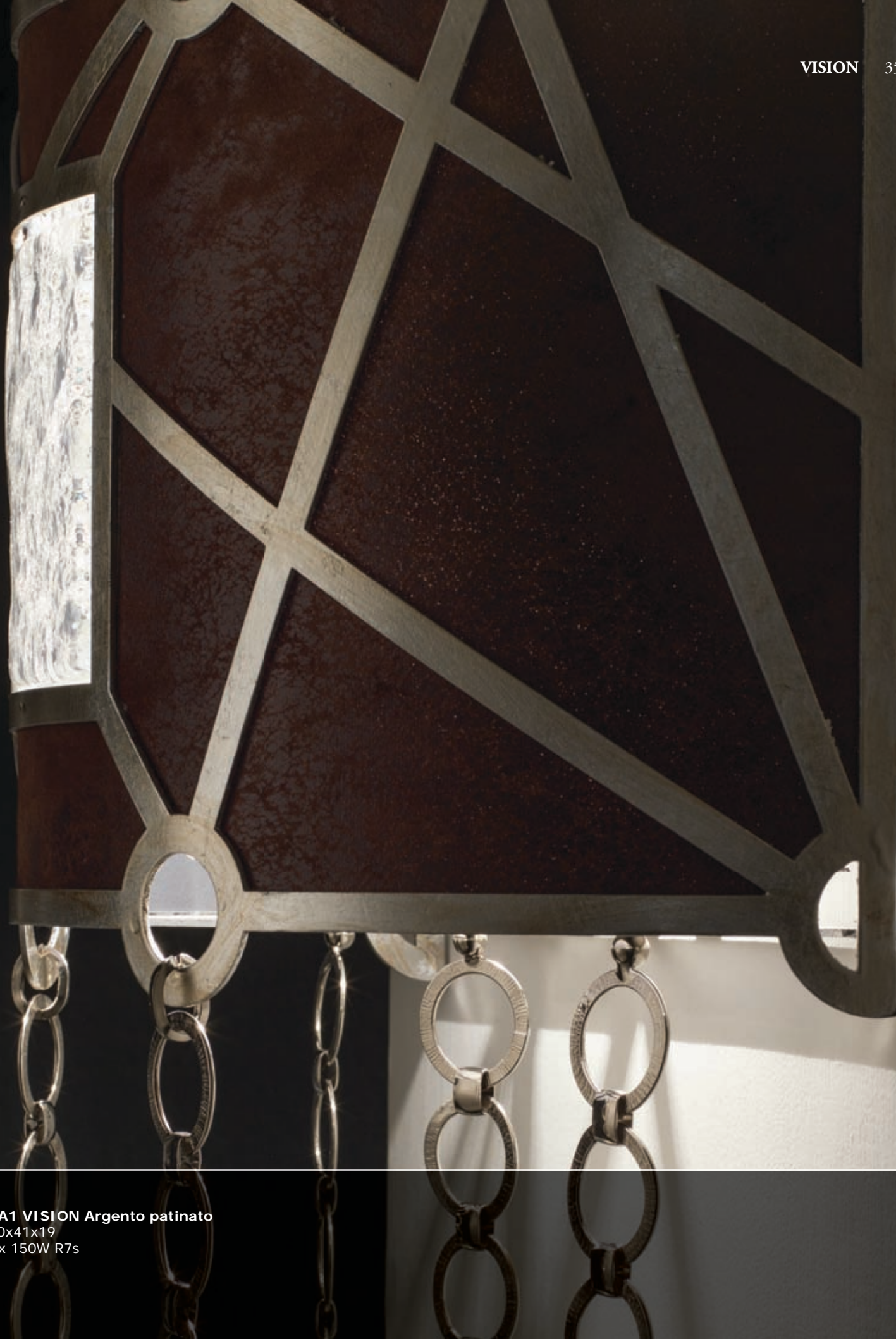
← 1877/A1 VISION Argento patinato h cm 30x41x19 Hal max 150W R7s