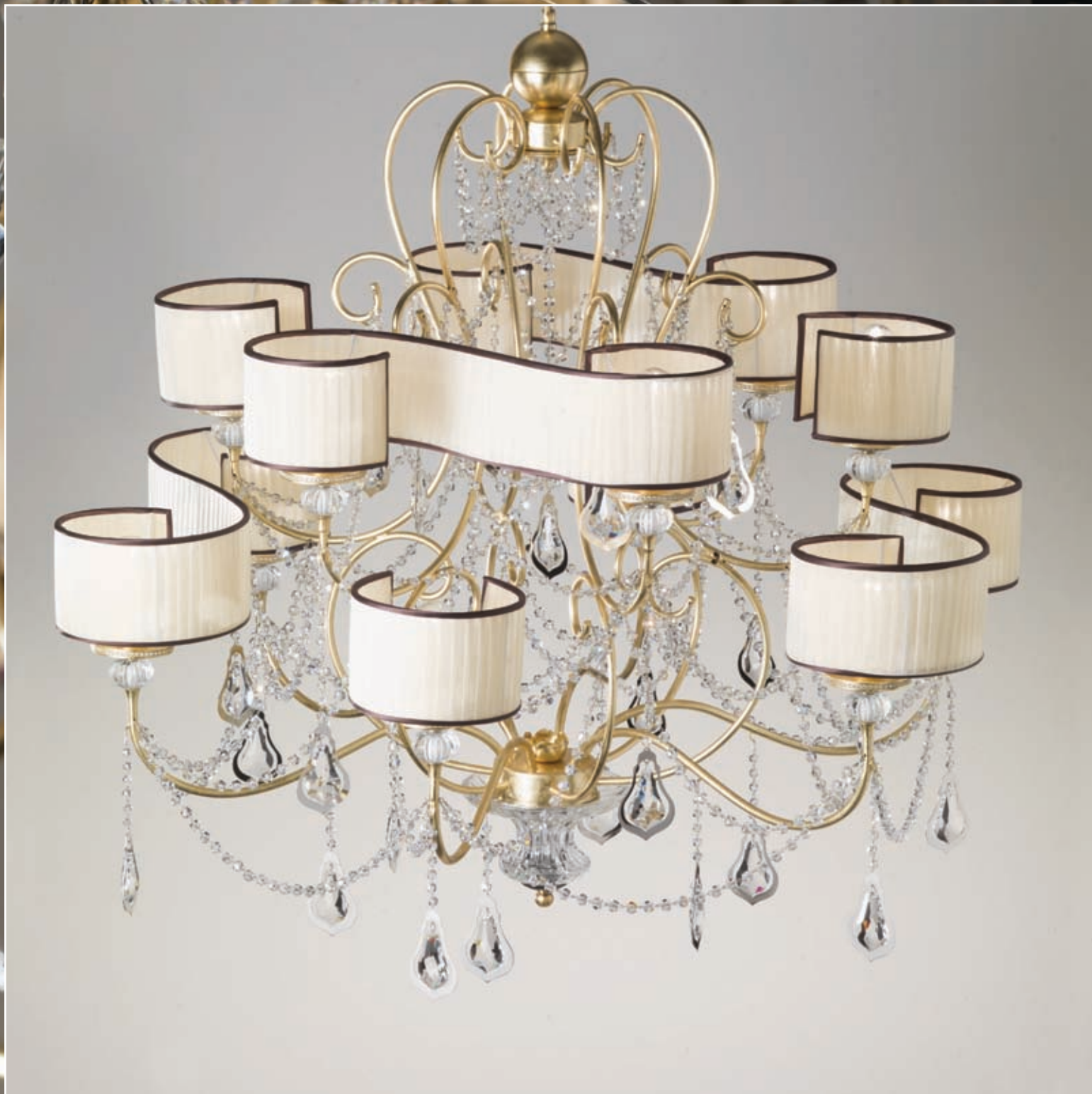
1876/12 FOULARD Oro moka Ø cm 105x105 h 12 x max 60W E14