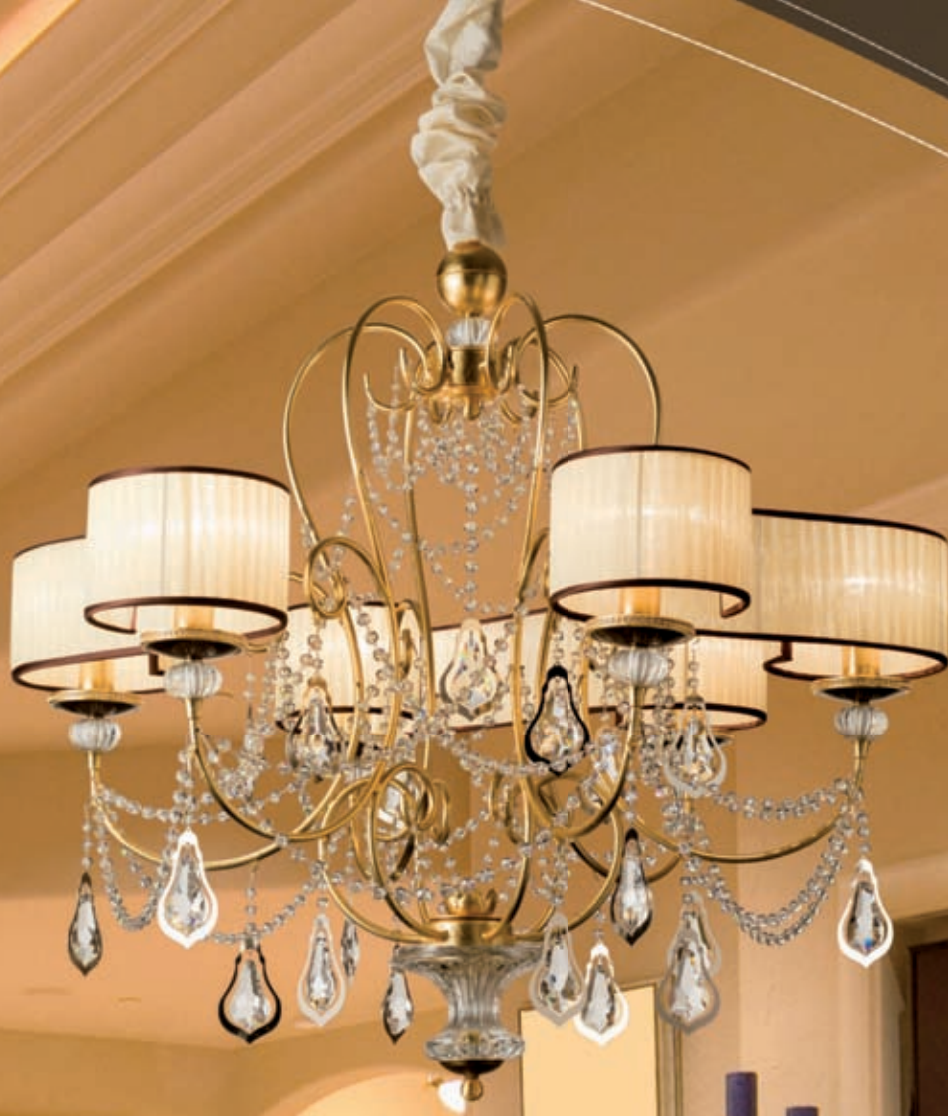
1876/6 FOULARD Oro moka Ø cm 82x82 h 6 x max 60W E14