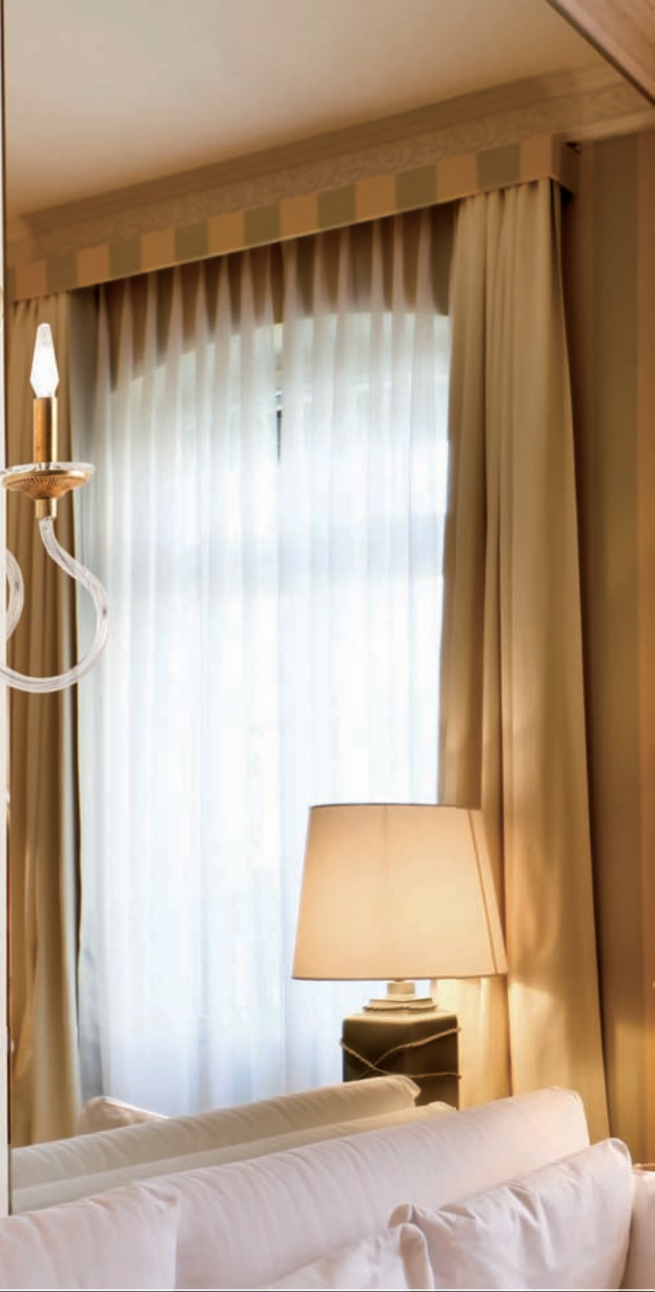
→ 1878/6 DECO Bianco oro Ø cm 85x63 h 6 x max 60W E14