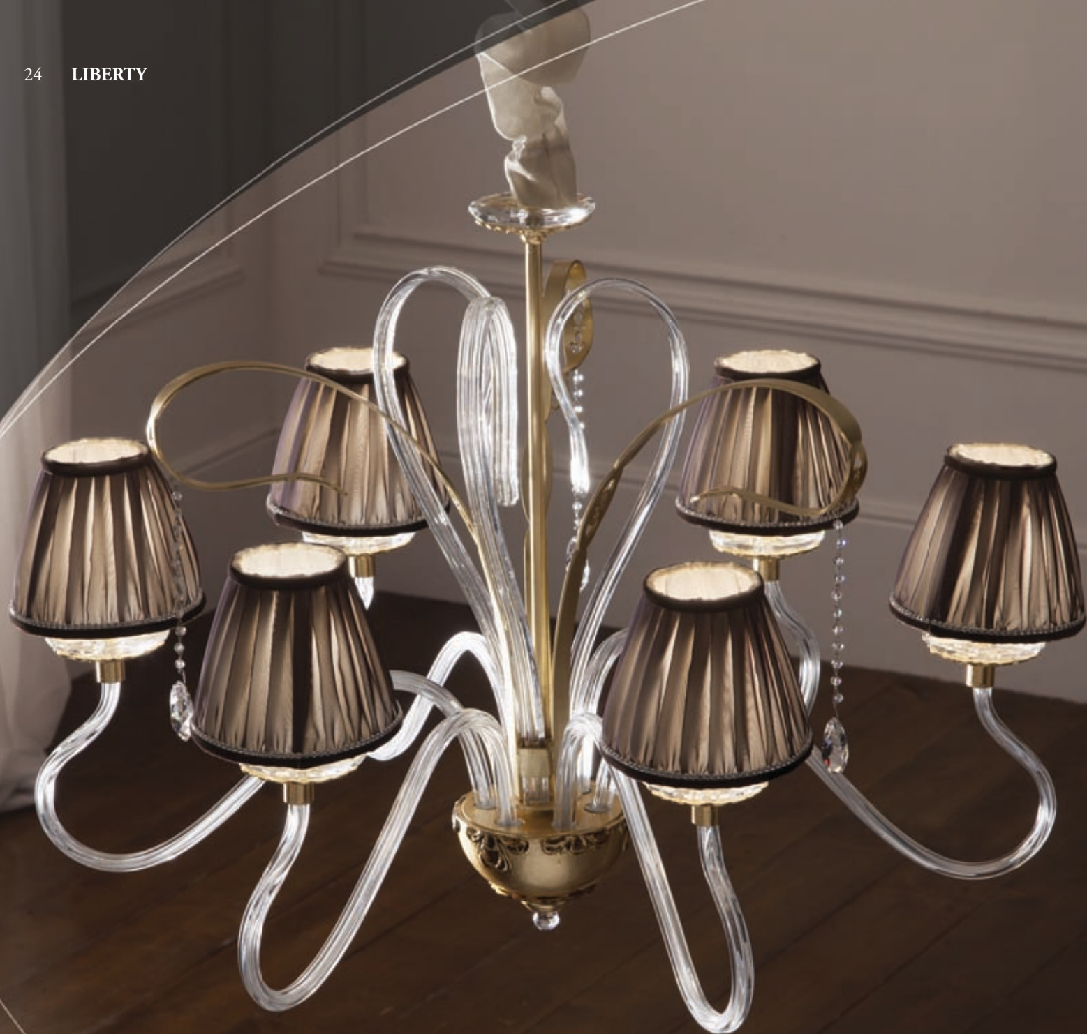
↑ 1875/6 LIBERTY Oro cannella Ø cm 85x63 h 6 x max 40W E14