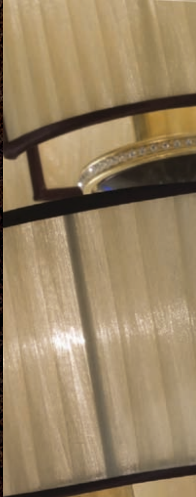
FOULARD pag. 6